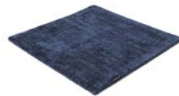
velvet blue 3185