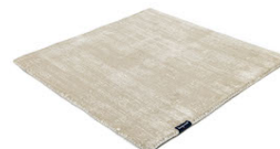
flat white 3231