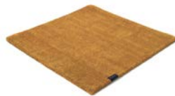
juicy orange 3175