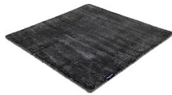
dark pepper 3261