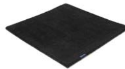
squid black 3189