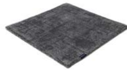
shark grey 3188