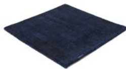
cosmic blue 3179