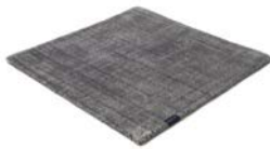
zen grey 3187