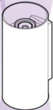
ULTRA X DOWN-UP